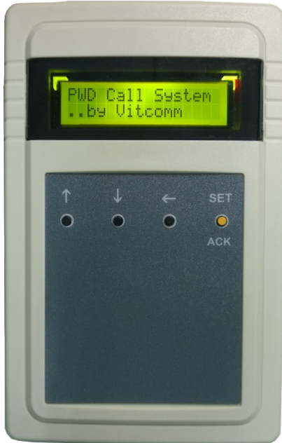
PWD Zone Controller