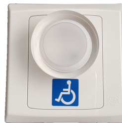
Over-door Alert Light and Sounder (Handicapped Toilet)

Smart Call Button (with built-in sounder)