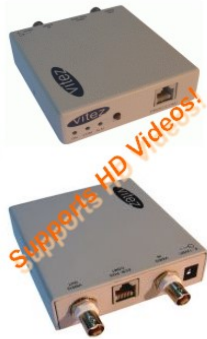
TOV-340A / TOV-340HD

The TOV-340 text inserter is designed for single cash register applications on any BNC video surveillance systems. The text inserter captures and superimposes cash receipt transaction data onto live video with the cashier's activities recorded on the surveillance systems.